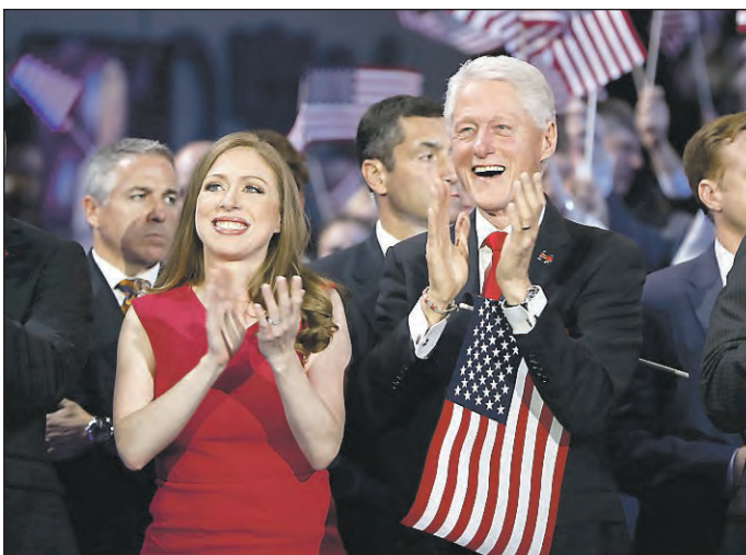
Chelsea Clinton and former President Bill Clinton applaud as Democratic presidential nominee Hillary Clinton speaks during the final day of the Democratic National Convention in Philadelphia.