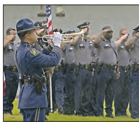
BATON ROUGE Slain officers are honored in Louisiana Nation+World » A11