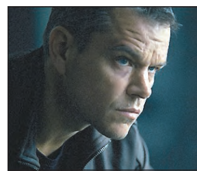
NEW MOVIES Superspy Bourne now is back in business Spotlight