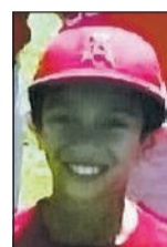
Jordon Discovery Bay third-grader loved baseball.