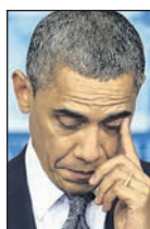
Tearful President Obama calls for action after shooting. 5A

NEWTOWN, Conn. — A man killed his mother at their home and then opened fire Friday inside an elementary school, massacring 26 people, including 20 children, as youngsters cowered in fear to the sound of gunshots reverberating through the building and