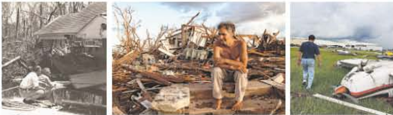
AUGUST STORMS » Notable August hurricanes, from left, Donna (1960), Andrew (1992) and Charley (2004) left the Florida landscape scarred. Though there was not one storm this July, experts warn anything can still happen.