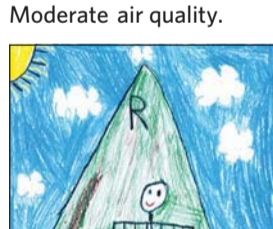
Art by Ethan Brown.

Low clouds, then sun. Moderate air quality.