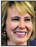
Gabrielle Giffords Husband contacted her friends in House.