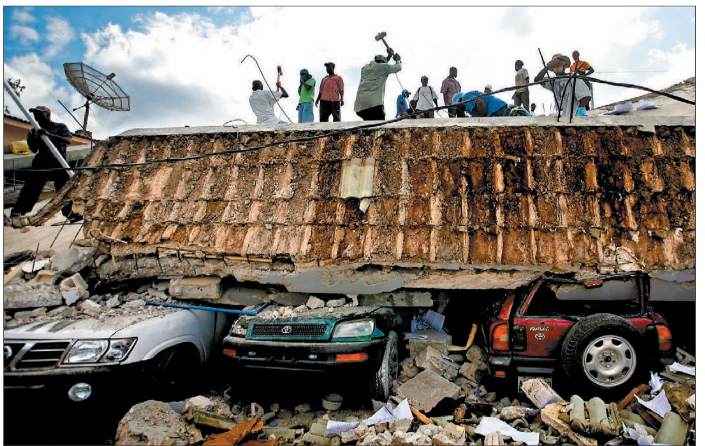
Earthquake survivors use sledgehammers and what else they can find to try to penetrate the rubble of a collapsed