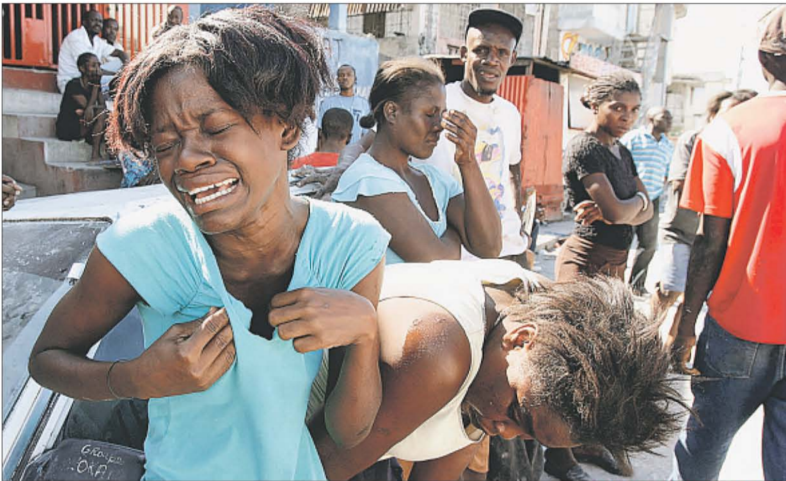
Girls cry as the body of a little girl is removed from the rubble Wednesday in Port-au-Prince, Haiti. The country's president fears chaos in the wake of the ruinous tremor.

Calls made to ease rules for Haitians here illegally. A7