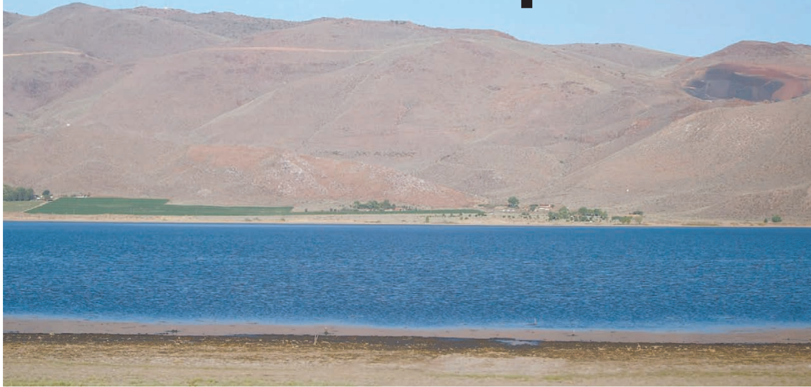
McClellan Peak, seen at the top left of the ridge, is the southernmost point of a proposed wind farm stretching north along the Virginia Range to Geiger summit.