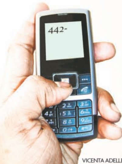
VICENTA ADELE MAPILIS PHOTO ILLUSTRATION

New phone numbers would bear the 442 area code under a plan pushed by San Diego-area chambers of commerce.