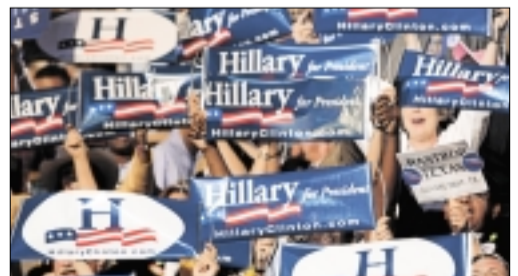
Delegates show support for Hillary Clinton on Tuesday night.

GOP 'war room' revs up as Romney hits the airwaves, 5A