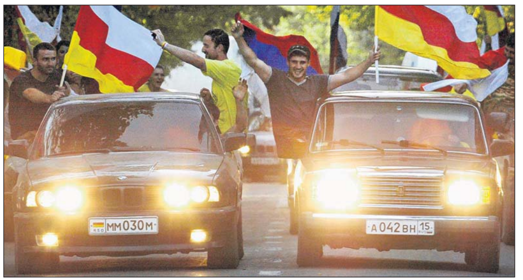
Ossetians celebrate as U.S.-Russia tensions rise Page 5A