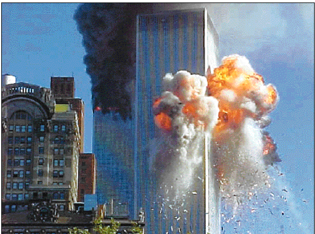
SECONDS AFTER: A fireball explodes from the south tower after the United jet airliner crashes into the building. The tower collapsed around 10 a.m.

S tunned Americans grieved for the thousands killed Tuesday in the deadliest terrorist attack in history. They drew a collective breath as the assaults on New York and Washington, D.C., evoked memories of Pearl Harbor. Much of the government closed and air travel was shut down, along with the financial markets. Americans sought news of missing loved ones, gathered in prayer, donated blood and worried about the safety of our cities and our skies. And there were so many questions. Who did this, and why? How could it have happened? How will America respond?