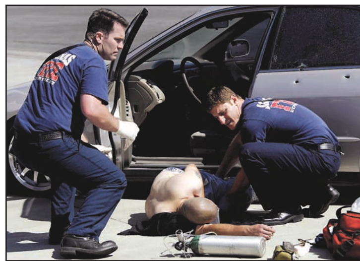
Salinas firefighters tend to a shooting victim in the driveway of the fire station on West Alisal Street on Thursday.