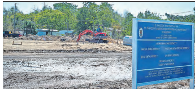
Work continues on a parcel on land on U.S. 1, south of St. Augustine, that will be the site of a St. Johns County Fire Station and the St. Johns County Sheriff's Office South Regional Command Center on Wednesday.

Volume 125, No. 81 2 sections, 24 pages © 2018 GateHouse Media