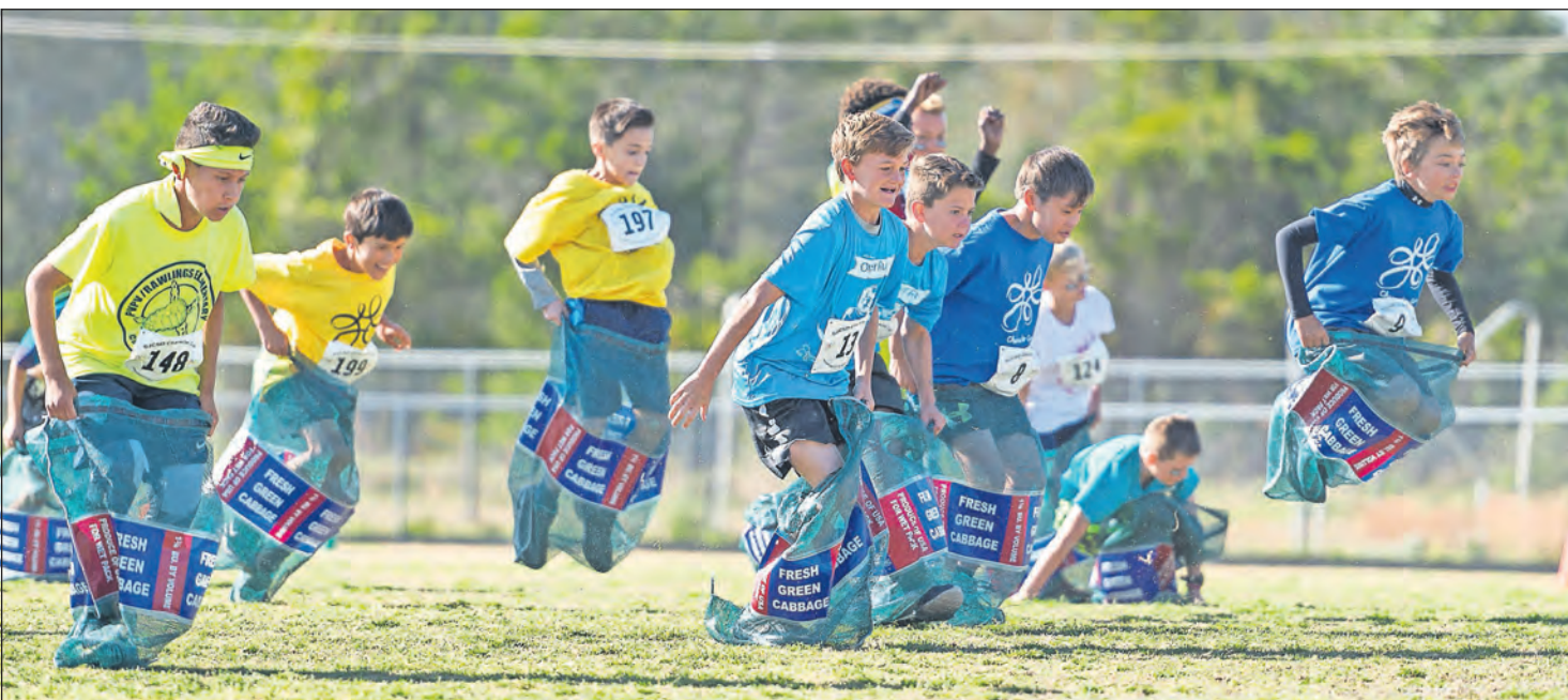
Boys from county elementary schools compete in a sack race during the St. Johns County School District's annual Character Cup, an Olympic-style competition held at St. Augustine High School on Thursday.

The Players donates $500,000 to St. Johns County Schools for Character Cup